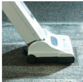
Vacuum when dry, usually after 30 minutes.