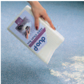
Apply duo-P Cleaning Powder.