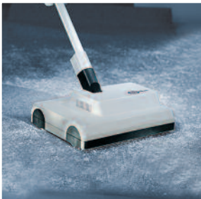
Brush in the duo-P Powder with the duo Brush Machine, Daisy or Hand Brush.