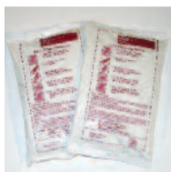
Refill package contains five, 1.1 lb. refill bags. Each single 1.1 lb. pack can clean up to 250 square feet of carpet. #0472AM

When the powder is worked into the carpet fibers, the moistened sponge-like granules lift soil and stains out. Within about 30 minutes, the powder is dry and is removed by vacuuming, leaving the carpet or upholstery clean, dry and ready for use.