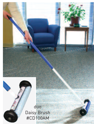
duo Daisy Brush #CD100AM

– This duo accessory is a necessity! The Daisy is a single brush and is not motorized. However, it is the ultimate in convenience because, with its adjustable handle and very light weight, one can work in a comfortable upright position and clean both small and medium-size carpeted areas, such as hallways or an entire room. It can also be used to clean the carpet and upholstery in cars, boats and RV’s. The Daisy even offers two brush bristle options for different types of carpet: easy or aggressive. Its adjustable handle accommodates user height preferences and enables it to be stored in small spaces.